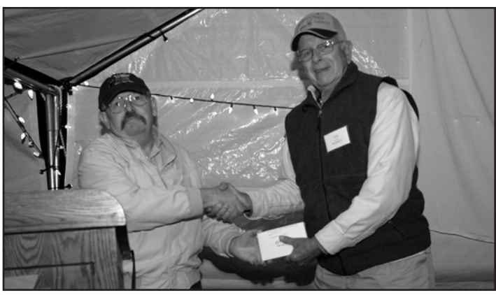
Dr. Jack Beck Award for Outstanding Youth Outreach Winner — Hokendauqua