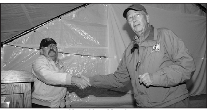
Most New Members Winner — Cumberland Valley (63)

Judge's comments: This award goes to an individual or group, not necessarily a TU member, whose volunteer effort has helped TU attain its mission either on a project or overall basis. She has helped at the fall meeting for many years; makes lunch and dinner for all members in attendance; is not a member, and is not paid; she simply volunteers and takes vacation to help Council; buys the food, cooks it and serves it for dimes compared to what it would cost to have these meals catered; the food tastes great; she also does all the dishes and makes sure the kitchen is spotless at the end of the weekend.