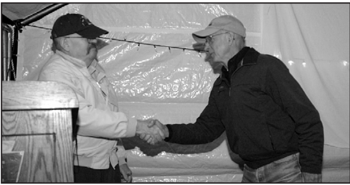
Greatest Percentage Increase in Memberships Winner — Caldwell Creek (40%)