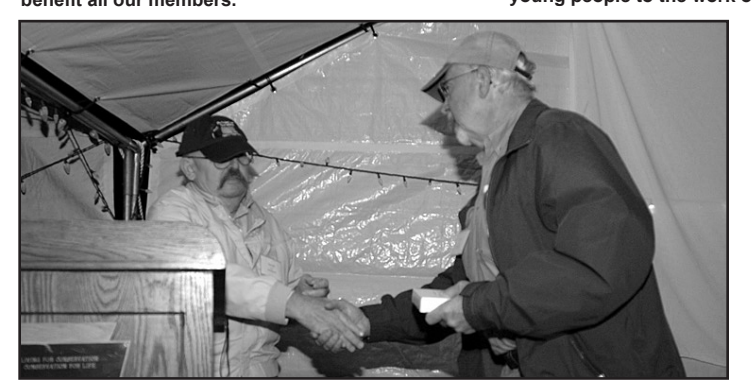
Samuel Slaymaker Award for Best Newsletter Winner — Donegal

Judge's comments: This chapter has slightly more than 100 members that have been exceptionally active this past year. Some of their accomplishments include: yearly fly tying classes; an annual fly fishing clinic; eight schools in the TIC program; an Allegheny National Forest water quality monitoring network project; a Cathers Run watershed assessment; Project Healing Waters; membership in the Mill Creek Coalition; participation in the Piney Creek Restoration cleanup; North Fork fly area habitat improvement; membership in the Allegheny Wins Coalition; the water quality monitoring network collaborative school program; and its yearly banquet was as successful as much larger chapters.