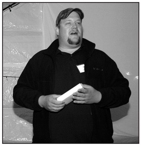
Best Small Chapter Winner — Iron Furnace

Judge's comments: This award is for the chapter's Wolf Run habitat improvement project. It highlights a solution to a problem many of our chapters face, namely, how to conduct a project for chapters with many older members. By enlisting the support of three local TIC schools, the chapter was able to attract younger people to help successfully complete the project is a less strenuous manner for the older members and in much less time, plus it attracted young people to the work of TU.