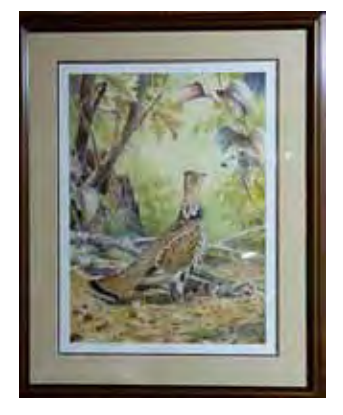
2nd Prize Framed Ned Smith "Greenbrier Grouse" Conservation Edition Print