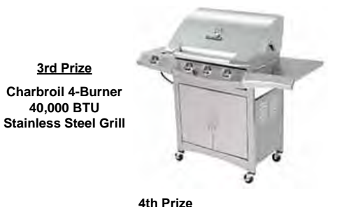
$200 Cash Card for a Store of Your Choice