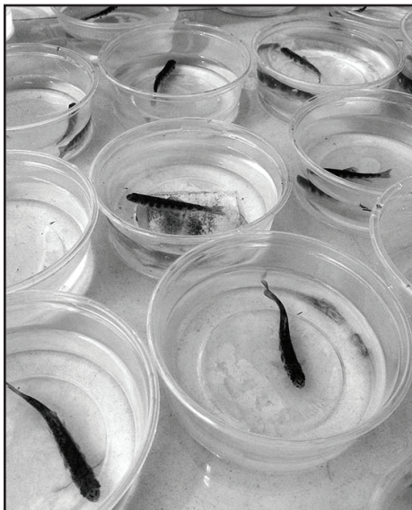
The trout are ready for release in their individual containers.