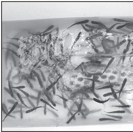
The fingerlings are transferred into an aerated cooler for transport.

It was a great culmination of a great project!