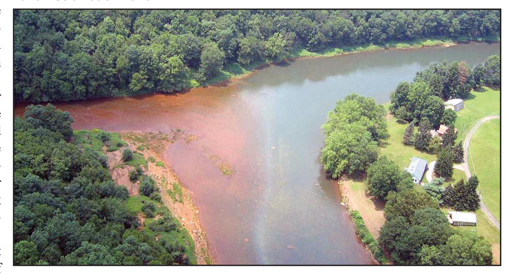
Trout Unlimited is helping partners plan and implement mine drainage treatment projects in the the West Branch Susquehanna River watershed and elsewhere across the state thanks in large part to funding provided by the Abandoned Mine Land Reclamation Fund.

ity improve and fish populations multiplying, recent benchmark assessments show.